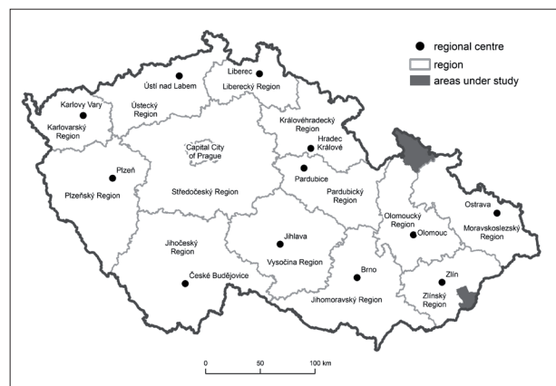
Fig. 2: Administrative regions of the Czech Republic Sources: ArcCR 500 version 2.0a; author's processing Note: The Region of Central Bohemia has its administrative centre situated in Prague

to migrate to another municipality in the region can be explained by poor job opportunities, which the respondents perceived very well. Therefore, in both regions, the answer “elsewhere in the Olomouc (or) Zlín region” dominated, where ‘region’ in these cases was the new Administrative Region (AR): see Figure 2. This is attributable to the fact that, first, the respondents in the case study areas have a good general knowledge of the area of these administrative units. Additionally, it is desirable to talk about a relatively strong identification of inhabitants in the studied areas with the Olomouc AR and the Zlín AR, which was demonstrated during our investigation. Although these spatial entities were only institutionalised in their current form in 2000, it seems that because of the purposefully constructed image of the Olomouc region and Zlín region through the creation of symbols, an effective influence of local media, and visibility of regional institutions and awareness building through the educational system, these new self-governing Administrative Regions have successfully rooted